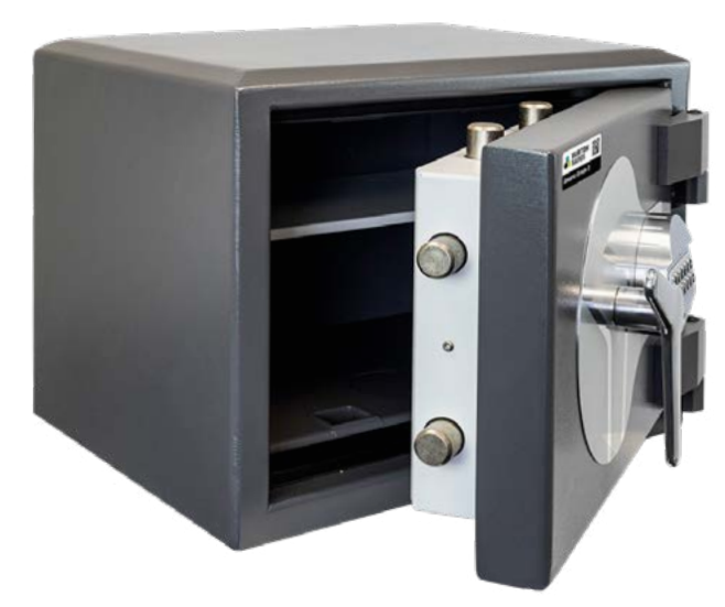
Amario Grade 2 Size 1