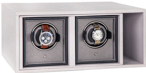
Watch winder module with storage pocket