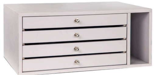
Jewellery module with drawers and storage pocket