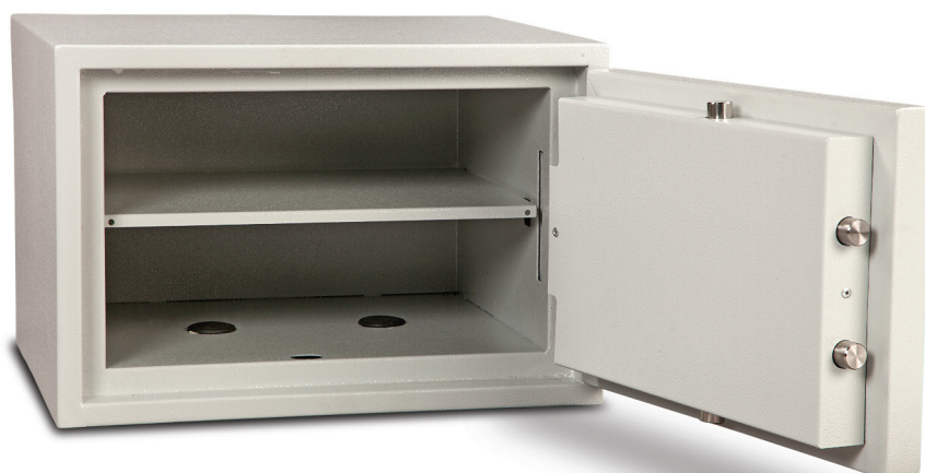
Eurovault Aver S2

£4,000 cash rating, £40,000 jewellery rating