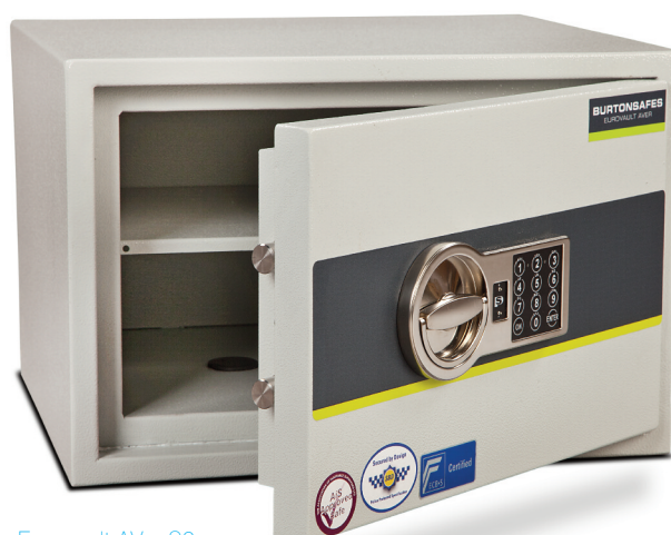
Eurovault Aver S2

Flocking options available for both interior/exterior Subject to additional charge and 8 week lead time