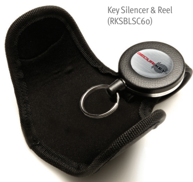
Key Silencer & Reel (RKSBLSC6o)