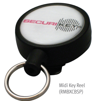
Midi Key Reel (RMBXCBS)