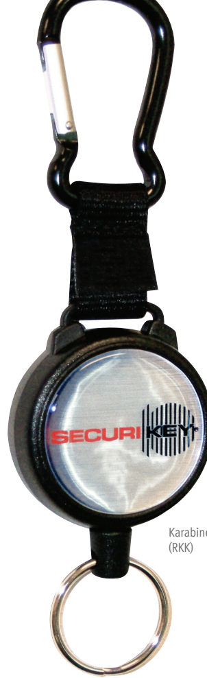
Karabiner Clip (RKK)