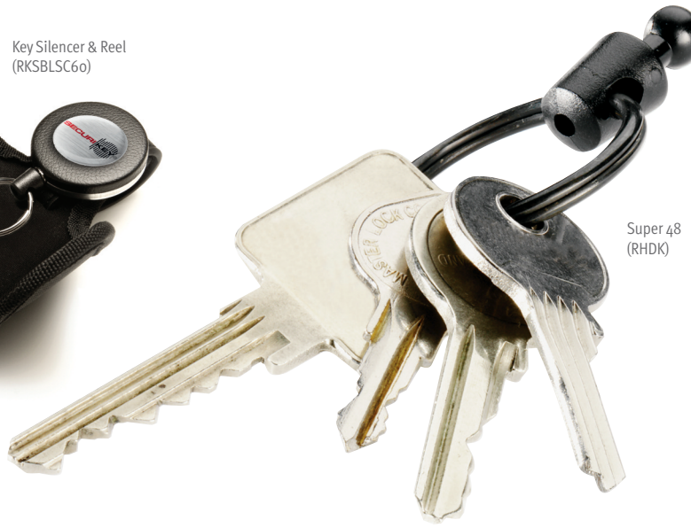
Super 48 (RHDK)