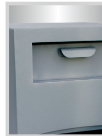
Mini Vault 2 Deposit